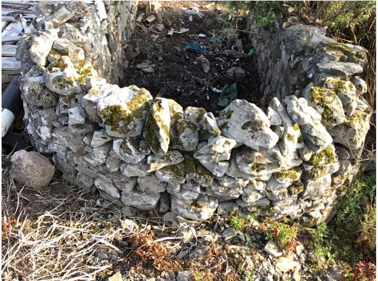
Figure 8. The boat noost viewed from the East