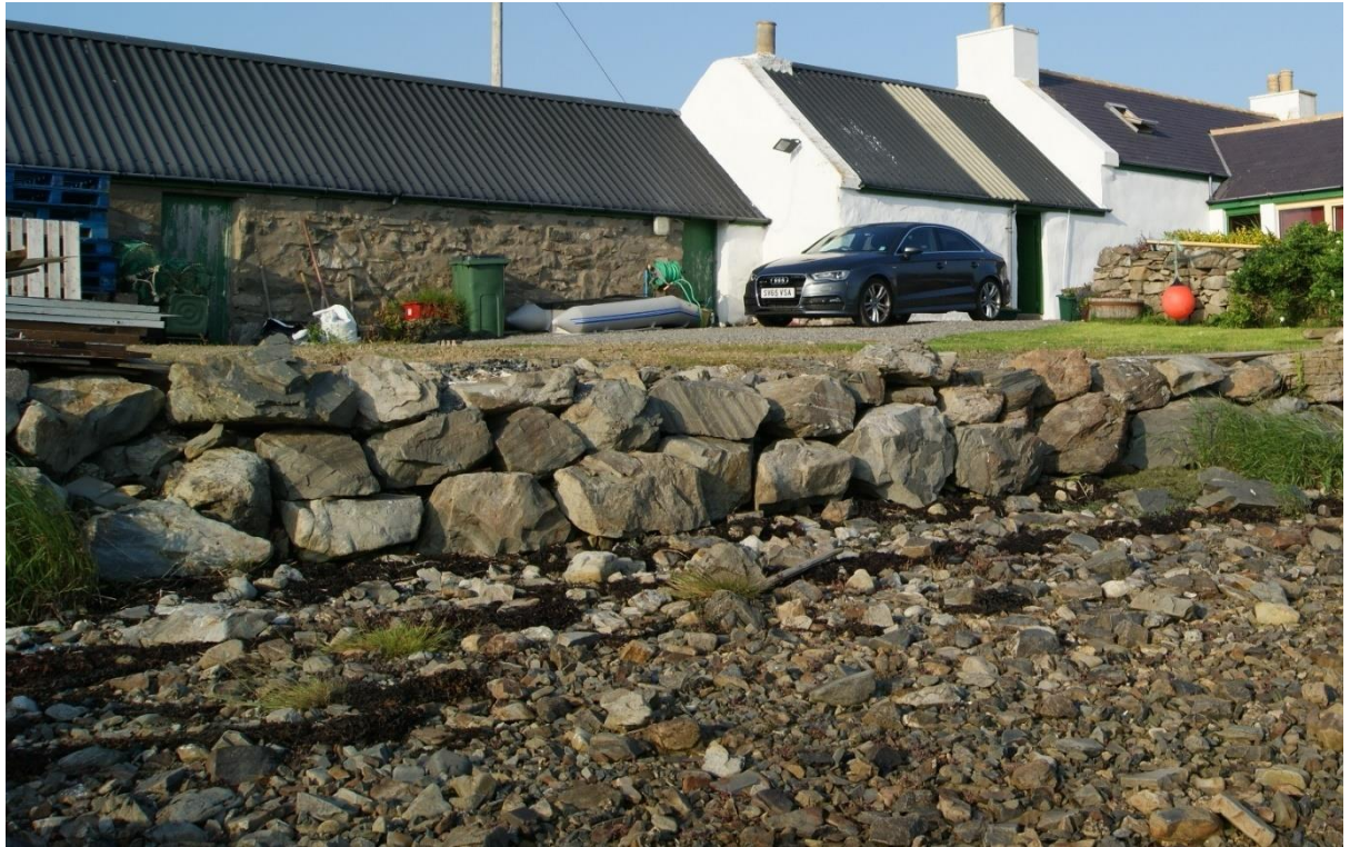
Figure 5. The same view in 2019