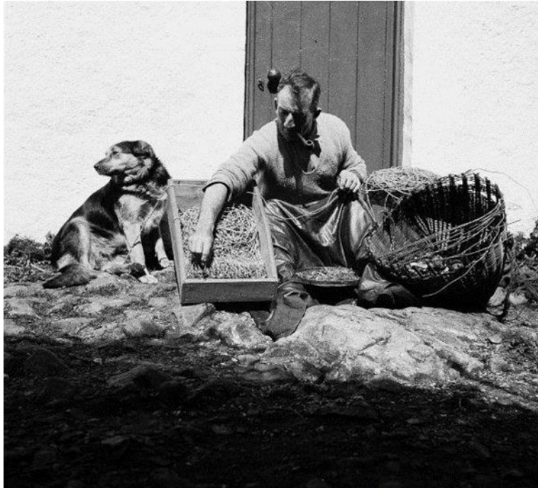
Figure 7. George Henry at Shoreside baiting haddock lines with mussels. Photographer Peterson, J. circa 1939-46. Photograph ©Shetland Museum & Archives P03719.