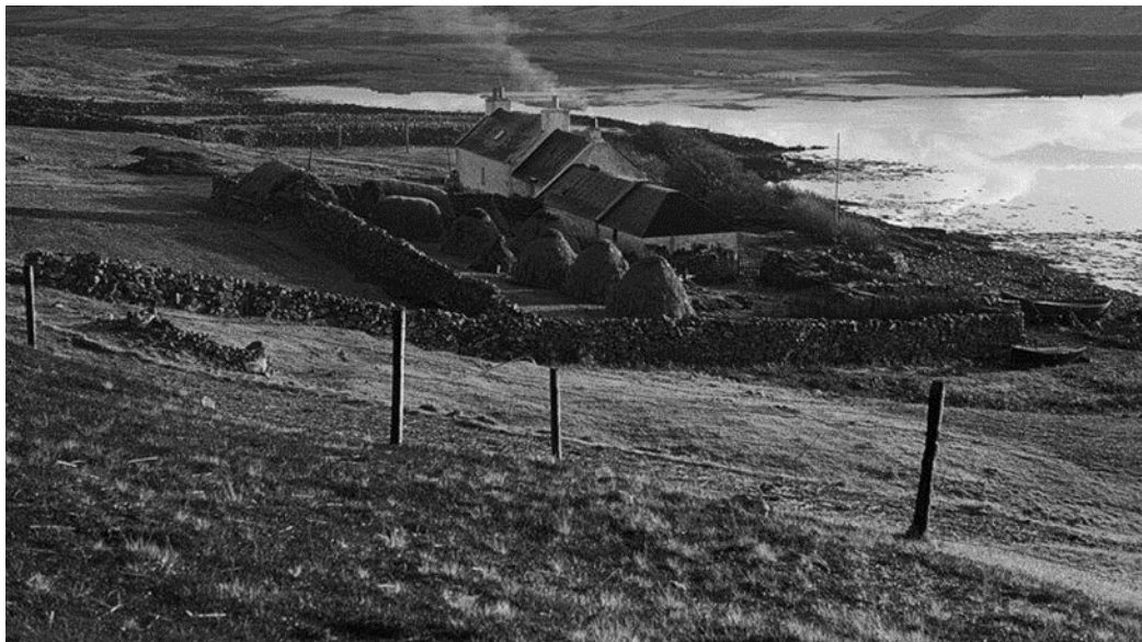
Figure 6. Shoreside, Photographed by Peterson, J. 1956. ©Shetland Museum & Archives PO4959.

The noost can be seen with a boat drawn-up in front and another boat lying alongside the wall.