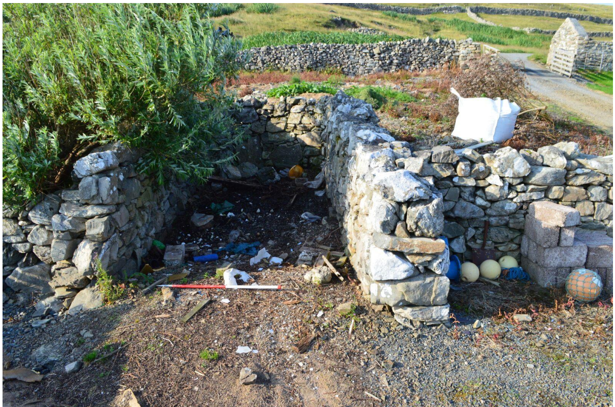
Figure 7. The boat noost viewed from the West.

Fieldwork was undertaken on 25 July 2019. The boat noost measures 6.6m by 2.7m (external measurement), stands to a height of approximately 1m and generally appears to be well preserved. The noost dimensions and construction are in keeping with typical noosts of the period and region, there is no evidence of reuse or remodelling.