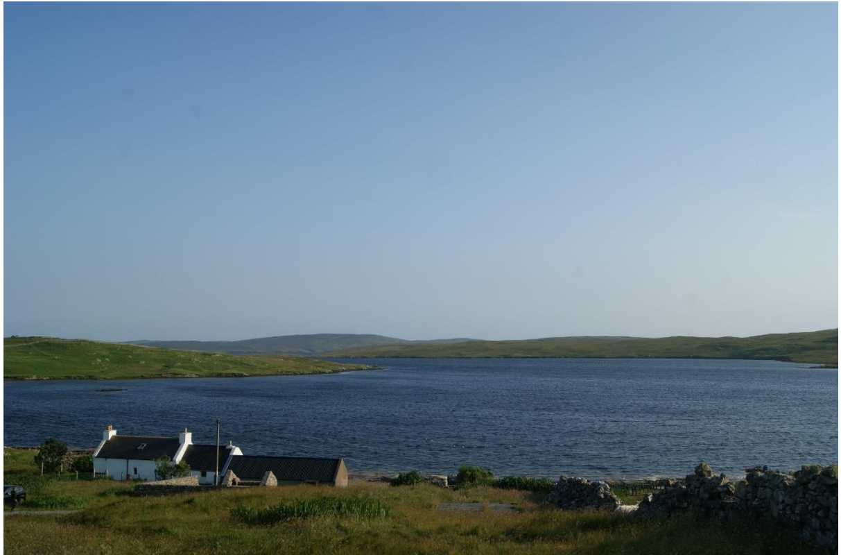
Figure 2. Shoreside.

A roofed structure on the same orientation and location as the current house at Shoreside is visible on the first Ordnance Survey map. Shetland mapping was undertaken in 1877-8 (National Library of Scotland); the structure continues to be visible on the same alignment in subsequent maps, suggesting the current house was standing by 1877.