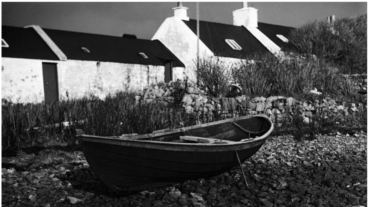
Figure 4. Fourareen at Shoreside, circa 1920.